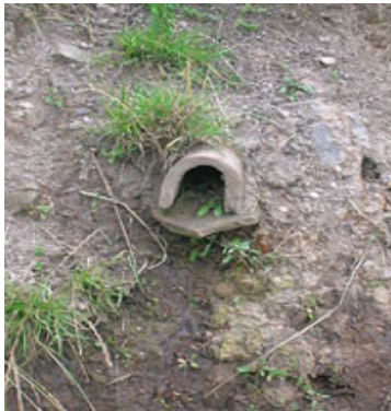
Figure 1: Cast Cement Tile

Since the water in tile lines has carried fertilizer through the soil, tile lines also provide a fortuitous place to sample irrigation water for nutrients to ensure crops aren't over or under fertilized. Figure 4 shows irrigation water sampling from a typical tile line. Nitrate is one of the most important nutrients to monitor.