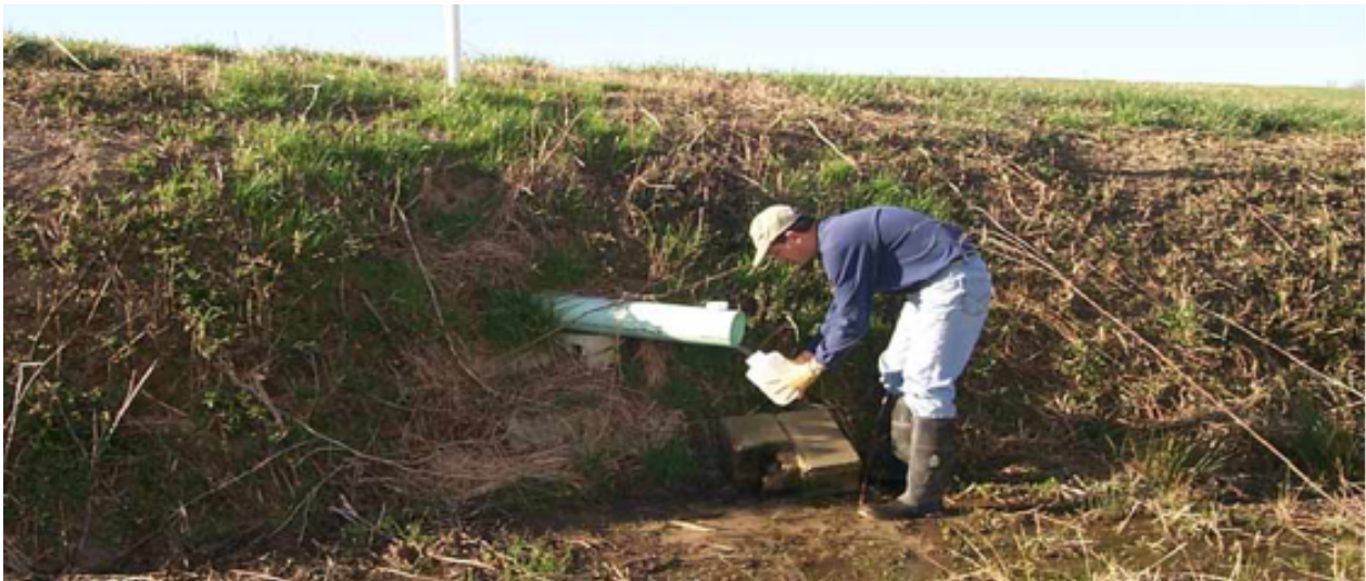
Figure 4: Irrigation Water Sampling from a Tile Line

Recently, a Soy Bean Association sent ten blind samples to an agriculture analytical contract lab. The intent was to compare ion chromatography (IC) nitrate analysis to the Timberline Ammonia/Nitrate Analyzer nitrate analysis which employs flow injection, membrane diffusion/conductivity for the determination of ammonia. To analyze for nitrate in aqueous samples the Timberline Analyzer uses an activated zinc reduction column. The samples are passed over the zinc reduction column prior to analysis where the nitrate in the tile samples is quantitatively reduced to ammonia. The zinc reduction column is capable of reducing nitrate to ammonia for several hundred to one thousand samples depending on the concentration of nitrate present in the sample.