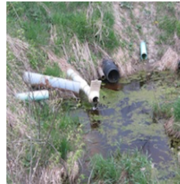
Figure 3: Plastic Tile Line and Tile Drainage Ditch