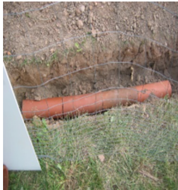
Figure 2: Modern Day Ceramic Tile